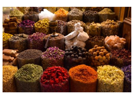
Day 9 Casablanca and Departure

You will be picked up and taken agriculturally to Rabat the capital of Morocco to will explore the Medina, the historic accompany us along the first town center which will sweep us stage of today's cycling tour of our feet. We will start cycling Sitting enthroned on top of a hill, along the coast and will finally be we will approach the majestic little taken by transfer to Casablanca, city of Moulay Idris, which is the biggest town of Morocco. Not surrounded by a fairytale-like only is this city famous for giving The its name to the classic movie, but statesman and founder Idris the also for it's exciting historic town first lies buried in this town, which center and especially the Hassanis why the city is said to be holy II-Mosque, which is the fifth and attracts many pilgrims every largest mosque worldwide. It is year. We will cross this town to able to welcome up to 25.000 Overnight