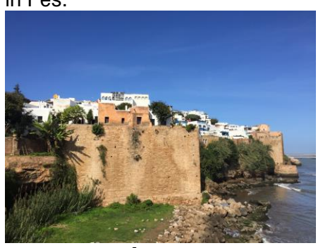
Day 7 Meknès 15 km

Fields sections characterized and nature. landscape reach the ruins of the city people. Volubilis, which dates back from Casablanca. the Roman times. Overnight stop in Fès.