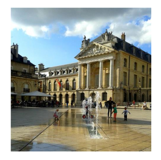
Day 2 Beaune - Dijon 42 km

Own arrival by car or train to Beaune. The charming hotel lies 5 km outside Beaune. Arrival at 6 o'clock and welcome drink. Diner at 7pm. Welcome to Burgundy!