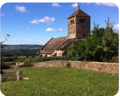
Day 5 Cluny - Tournus 37 km

The Côte Chalonnaises are a perfect geographical bridge between the famous wine-growing areas of the Côte de Beaune to the north and the Mâconnais to the south. This area is no less distinguished with its own array of famous appellations. At Comartin you can see the magnificent château and it's garden before you follow the cycle route to Cluny.