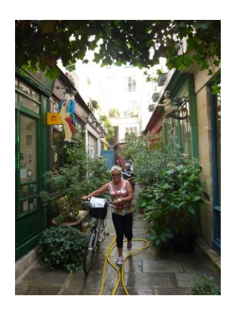
Day 4 Quartier Canal St Martin 18 km

A royal cycling day demands a royal finish! During the delicious dinner, quel plaisir, in a very charming restaurant, the staff transforms into opera singers. A fantastic atmosphere with amazing cuisine. An unforgettable evening.